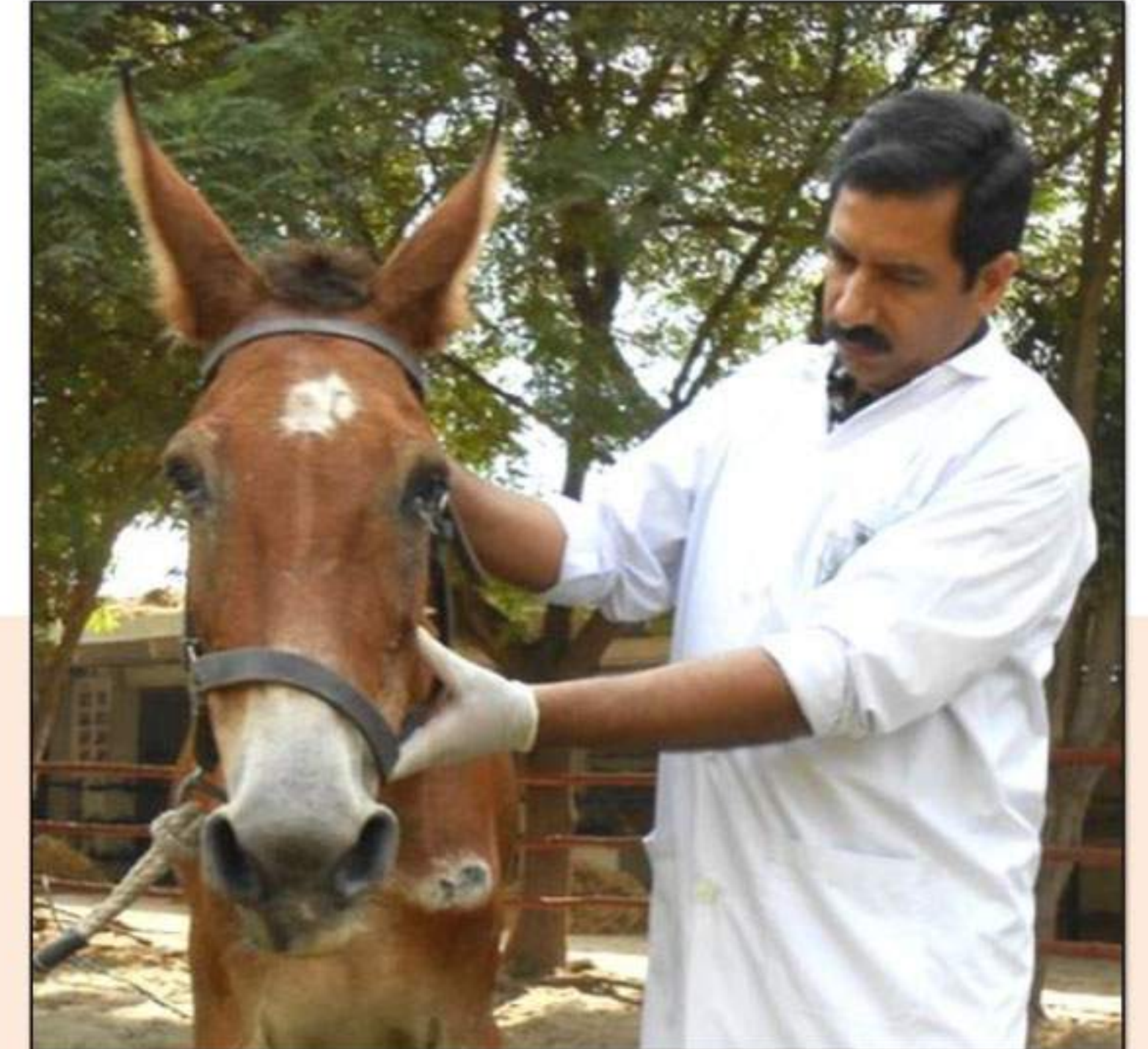
Figure 1: Tetanus affected animal showing flaring of nostrils and erect ears.

To record the impact of a community vaccination and awareness program in Rajkot community of Gujranwala district.