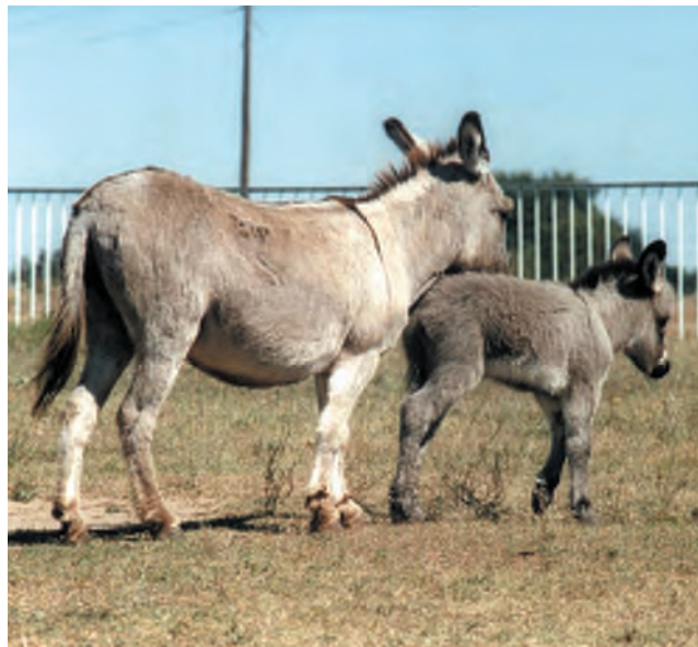
Fig. 3. Miniature donkeys are valued for their temperament.

fee for some excellent stallions of his time. The following year, the Marquis de Lafayette sent Washington a Maltese jack named the "Knight of Malta," which was described as "having the fire and ferocity of a tiger," but he was an excellent sire of mules. Thus, George Washington played a major role in the development of the mule industry in America. By 1840, a quality jack used for mule breeding could fetch up to $5000.00 in Kentucky, then as now, a state that leads in mule production.