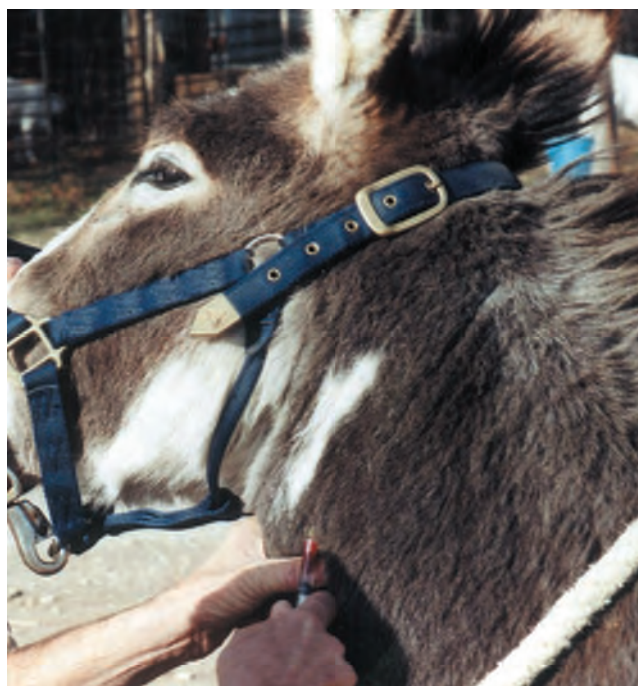
Fig. 9. Palpate the jugular vein in the upper one-third of the jugular furrow.

The shape of the donkey sacrum and the spacing and direction of the spines of the sacrum and coccygeal