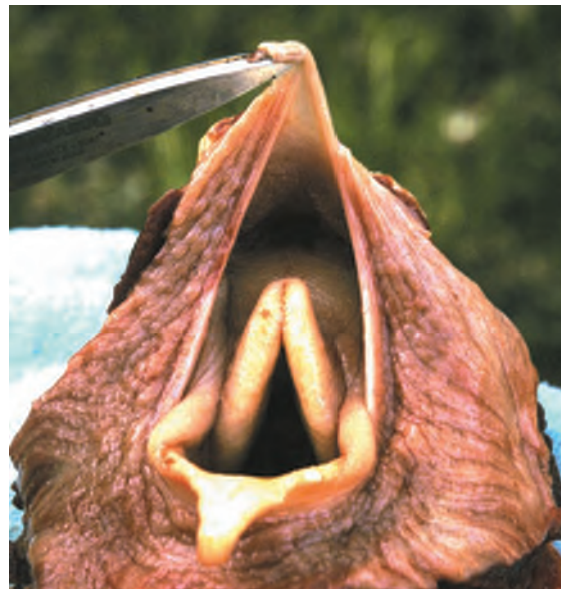
Fig. 6. This fresh specimen of the donkey pharynx shows how the donkey's laryngeal diverticulum could easily entrap a nasogastric tube.

One additional difference is that the donkey typically has a narrower ventral meatus than a horse or