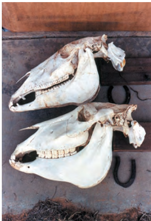
Fig. 4. Both the horse (top) and the donkey (bottom) weighed approximately 450 kg in life. The donkey was a mammoth breed of donkey.

status of the other sizes, yet this size is the work donkey in many countries of the world.