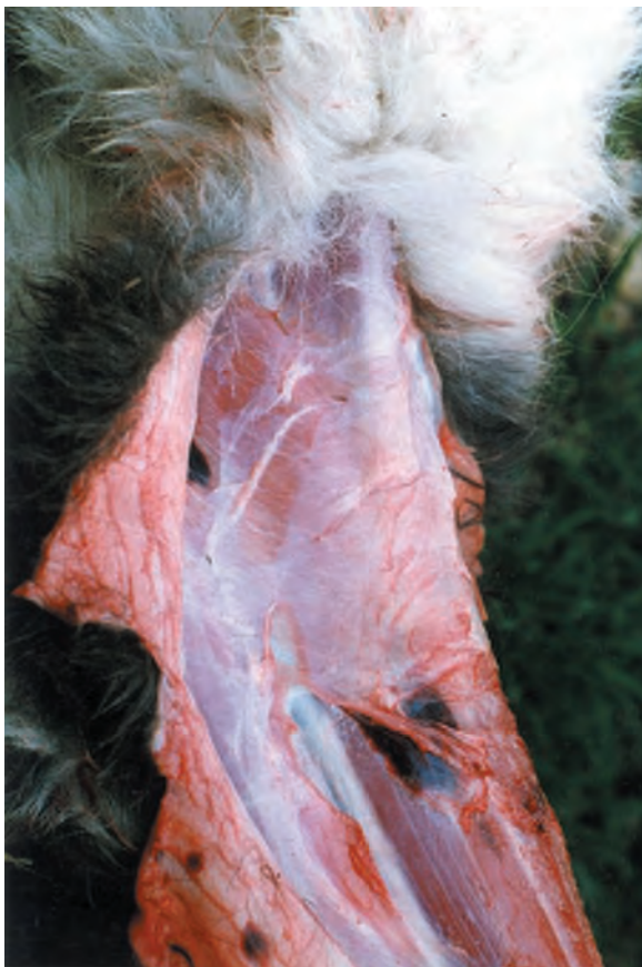
Fig. 8. Two-week-old miniature donkey foal. Even in the immature donkey, the cutaneous colli muscle obscured part of the jugular furrow and the jugular vein. The bruise (center) is the result of a failed attempt at venapuncture.

taneous colli muscle of the horse is a relatively small V-shaped muscle developed in the superficial fascia on the caudoventral region of the neck. It arises from the manubrium sterni and a median fibrous raphe. The fibers diverge dorso-cranially from this raphe to the sides of the neck, thinning out and blending into the superficial cervical fascia. 5