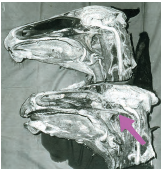
Fig. 5. Arrow indicates the caudal margin of the laryngeal diverticulum of the donkey in this cross-sectioned head. Compare with the horse above.

functional anatomy and the patho-physiology of the respiratory tract of the donkey were the primary goals.