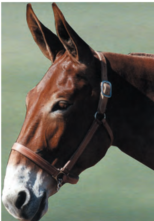
Fig. 1. "... without pride of ancestry, nor hope of posterity."

exceed that of the horse. These owners are looking to you for competent advice.