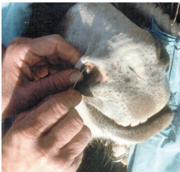
Fig. 10. The aperture of the nasolacrimal duct of the donkey is located on the flare of the nostril rather than on the floor of the nostril as it is in the horse.

vertebrae differ in the donkey. 9 Also, the location of the end of the spinal cord and the end of the dura differs from those of the horse. Injection of a local anesthetic into the epidural region necessitates knowledge of these differences. Indications for caudal epidural anesthesia in the horse include surgical procedures involving the tail, perineum, anus, rectum, vulva, and vagina (as for Caslick's suture, rectovaginal tear repair, prolapsed rectum, or tail amputation), and symptomatic relief of pain during