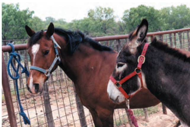
Fig. 2. Donkeys are not just horses with long ears.

In 1785, George Washington investigated the purchase of a good jack from Spain but was told that the exportation of jacks was illegal in Spain. However, when the king of Spain learned that George Washington wanted a good jack to produce work mules in America, he sent a jack and a jennet as a gift. The jack was named "Royal Gift" and stood at Mt. Vernon. "Royal gift" was between 14.2 and 15 H tall and commanded a stud fee that was higher than the