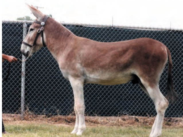
Fig. 7. Notice the shape of the neck of this large jack donkey. The jugular furrow is obscured by the cutaneus colli muscle.

According to the classic anatomy textbook, the horse has a thin myo-fascial layer, called the cutaneus colli muscle, that is peeled away during the dissection process to reveal the jugular furrow. The cu-