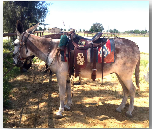
Mr Ear E Sistiable