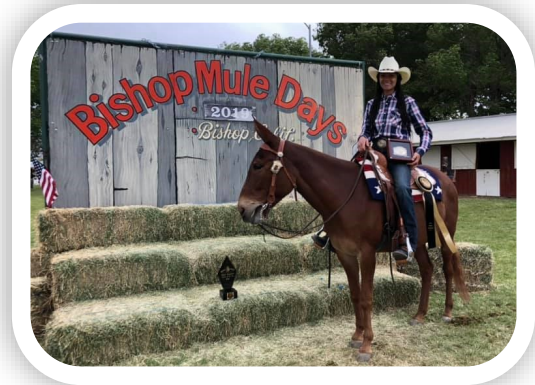
Strawberry & Abby