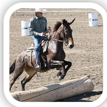
Tucker & Shufly